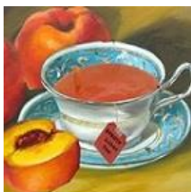
Fredericksburg TEA Party

Organizational names are for identification purposes.