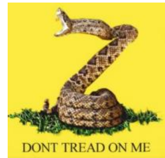
Cass County Patriots