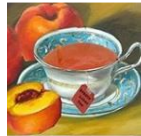
Fredericksburg TEA Party