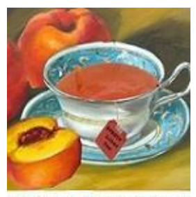
Fredericksburg TEA Party