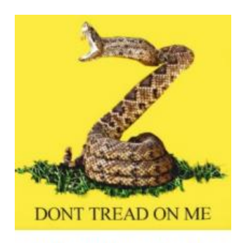
Cass County Patriots