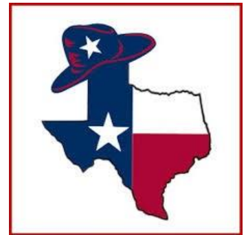
Red Texas Forum - Dallas