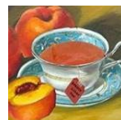
Fredericksburg TEA Party