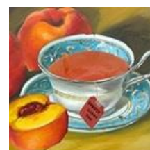
Fredericksburg TEA Party